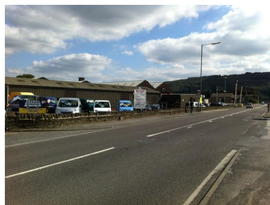
Airedale Trading Park

Thinking of selling/letting? If you have a property of which you are considering a disposal then please contact us to arrange a no obligation market appraisal.