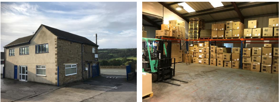
GUIDE PRICE - £650,000