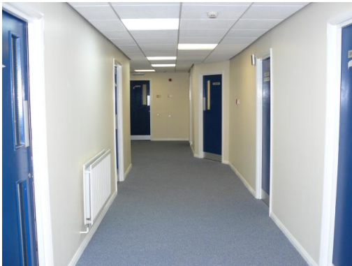
Internal Corridor serving office suites

First Floor High Quality Office Suites Available on an All Inclusive Basis - Private Car Parking Available GREAT DEALS/FLEXIBLE TERMS Rent £350 pcm inclusive