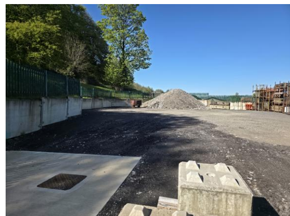
Yard available by way of separate negotiation

The ingoing tenant will be responsible for the landlords reasonable legal costs incurred during the preparation of the lease documentation